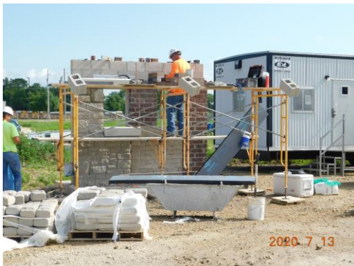
Veneer mock up work is taking place in order to be reviewed.