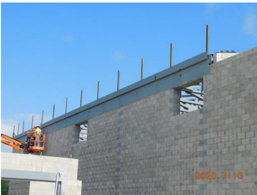
Steel detailing taking place along gym (angle iron is for roping off while work takes place)