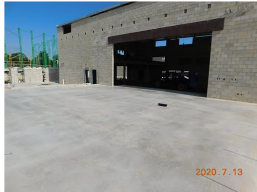
Concrete floor poured on the stage