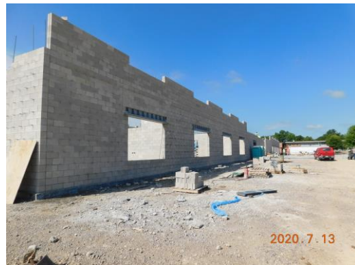
Unit D 1 st floor North exterior wall complete