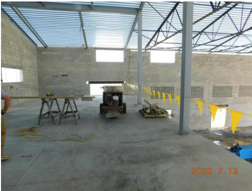
Mezzanine above student dining with concrete topping poured