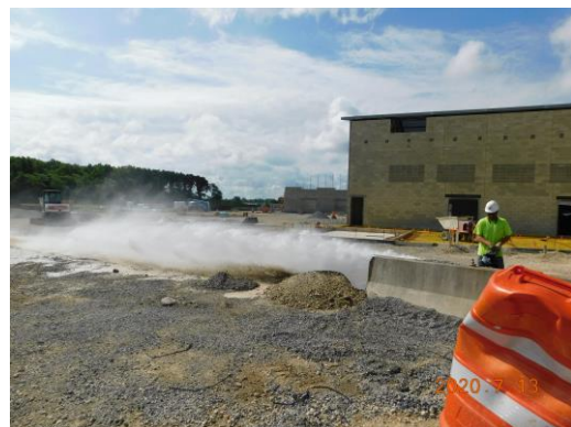
Hydrant flushing for water bacteria test