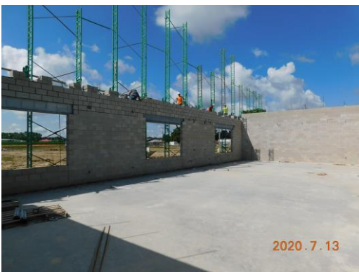
Unit C south exterior wall being completed