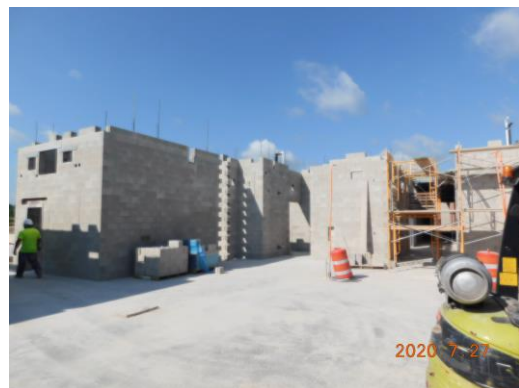
Unit C "Hub" walls being completed in preparation for steel joists