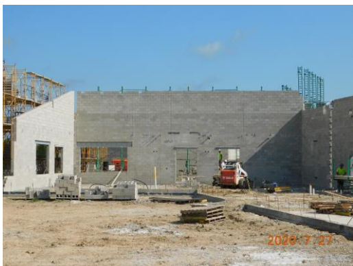
View of the administrative area from the South- looking North