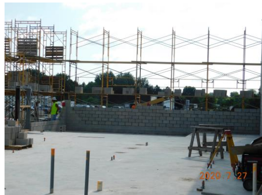
Masonry walls of the kitchen are being installed