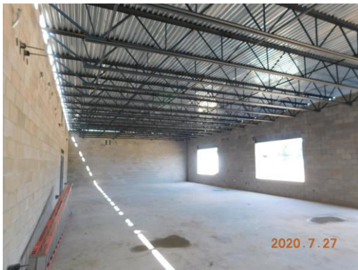
Steel decking installed above the Unit C classrooms