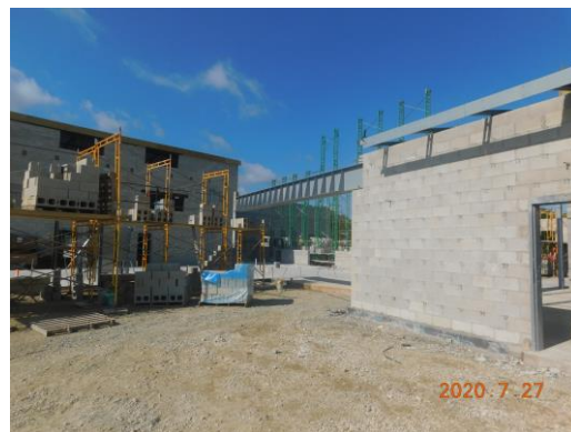
Steel beam installed at the A – B connector