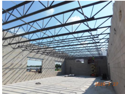
Bar Joist installation in the Unit D classroom wing