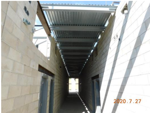
Steel decking installed above the Unit C corridor