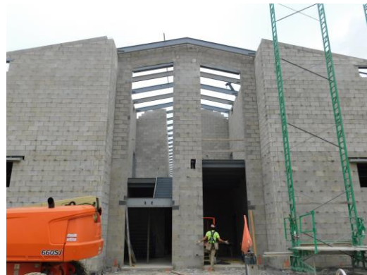
Steel for roof and stairs being installed in Unit D