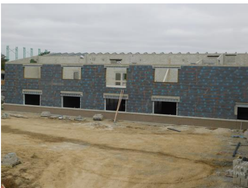
Cavity insulation installed on the south side of Unit C