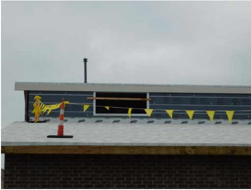
Fascia metal installation above the student dining