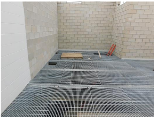
Metal floor grate installed in the Unit C mechanical room