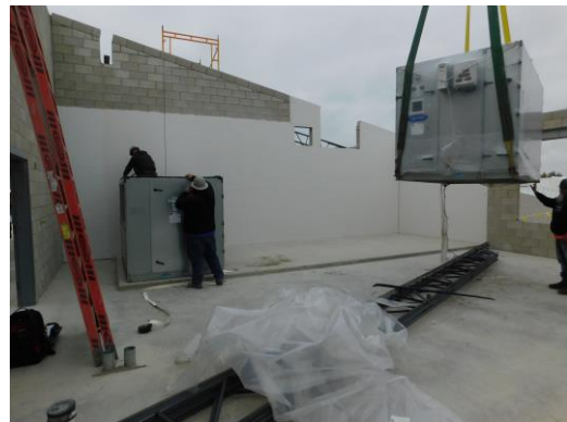
Unit D AHU being set on the 2 nd floor