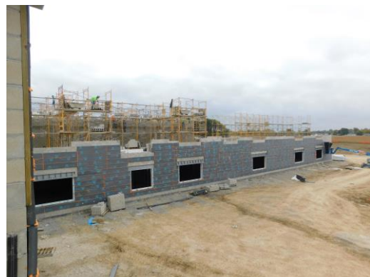
Cavity insulation installed on the west wall of Unit E 1 st floor