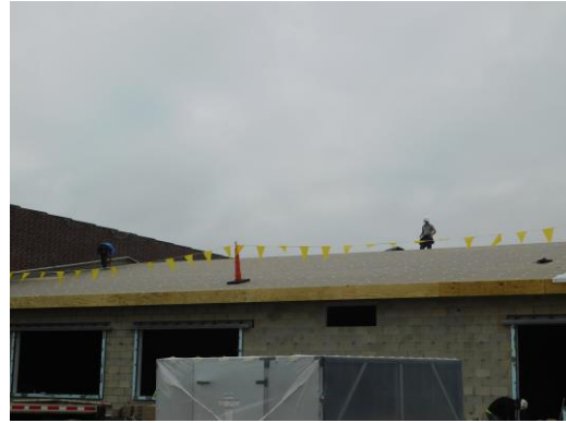
Roof dry in taking place at the B-C connector