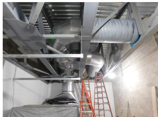
Ductwork installation from the Unit A mechanical room