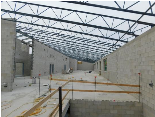
Unit C 2 nd floor steel being installed