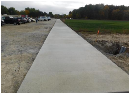
South sidewalk poured where the East parking area will be installed