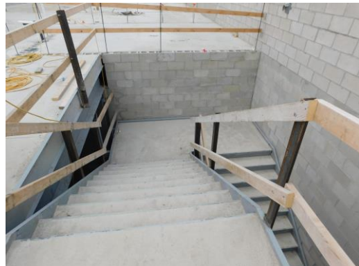
Concrete poured in the stair pans for Unit C