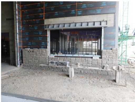
Stone veneer continues at the main entrance