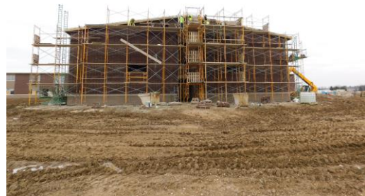
Veneer being completed on the south side of Unit E classroom wing