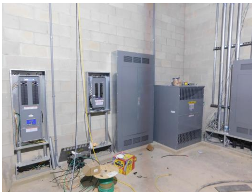
Electrical equipment installation in Unit C