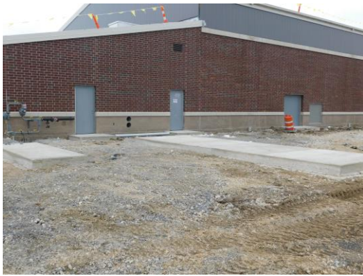
Equipment pads installed on the North side of the gym for the mechanical yard area