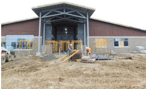
Scaffold being set up for the main entrance veneer installation