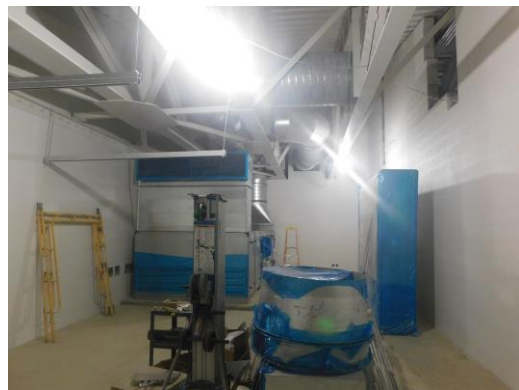
Paint started in the Unit A Mechanical Room