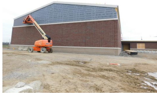
Metal wall panel installation continues on the West side of the gym